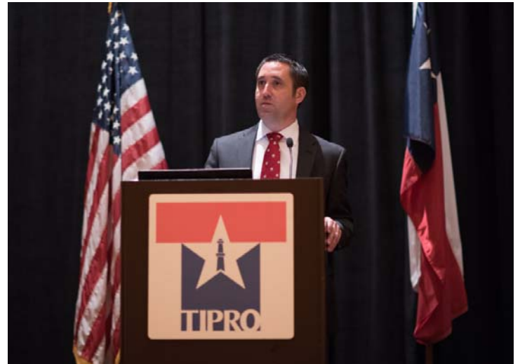
State Comptroller Glenn Hegar offers an economic update to TIPRO members