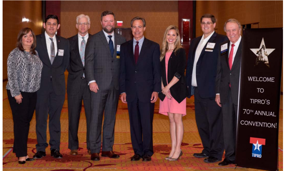
TIPRO board members and staff visit with Speaker of the House Joe Straus