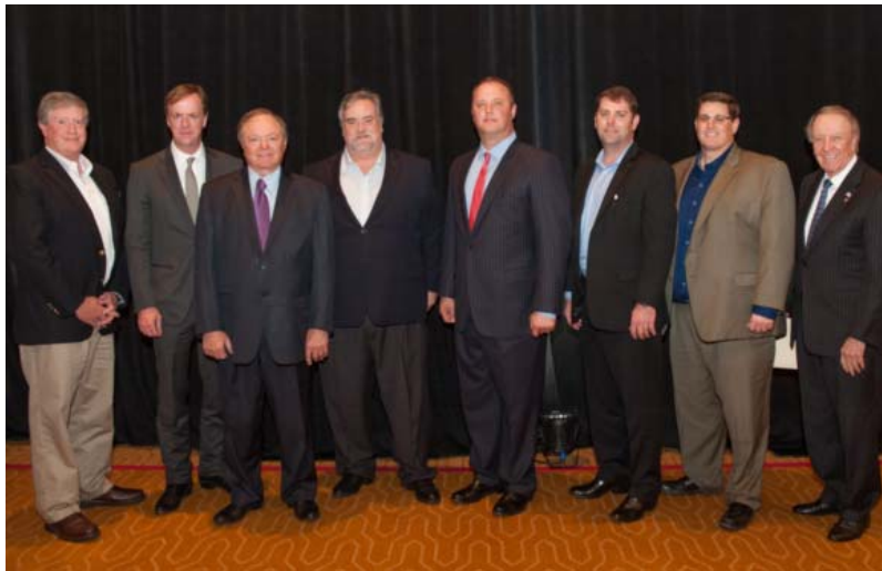
TIPRO executive leaders with Harold Hamm, chairman and chief executive officer of Continental Resources