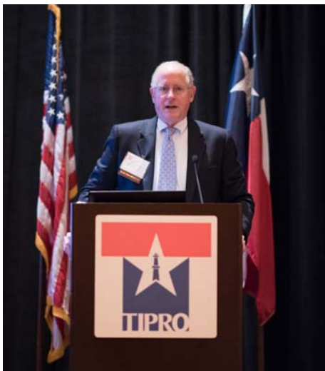
Congressman Mike Conaway presents at TIPRO's 70 th Annual Convention