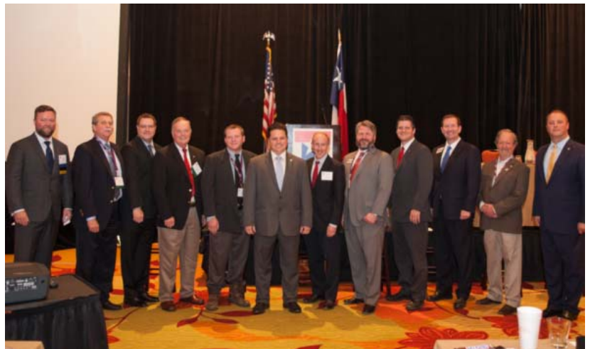
TIPRO's Railroad Commission Candidate Forum