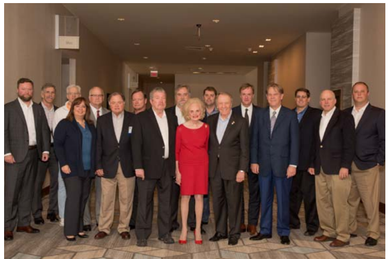
TIPRO's Board of Directors