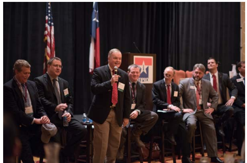
TIPRO's Railroad Commission Candidate Forum