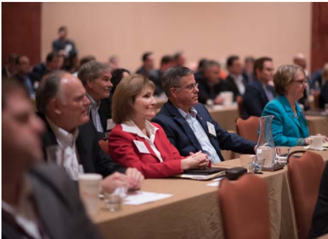
TIPRO members listen to remarks from conference speakers